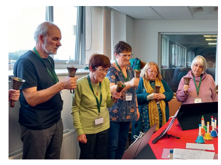
Some images from our 2023 Festival, 'For everything there is a season'